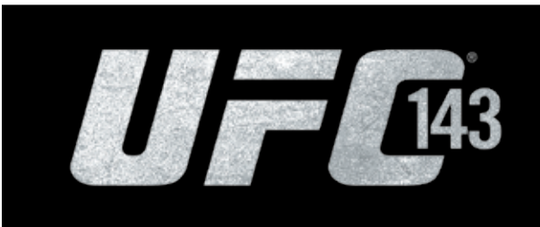
UFC 143 LOGO