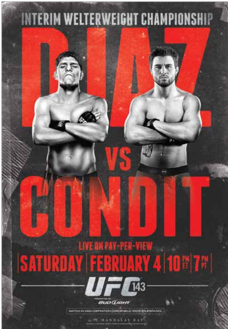
POSTER • 27"x 39" • CMYK • LAYERED • PRESS READY