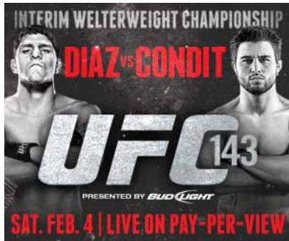
300 X 250