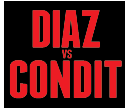
UFC 143 NAMES