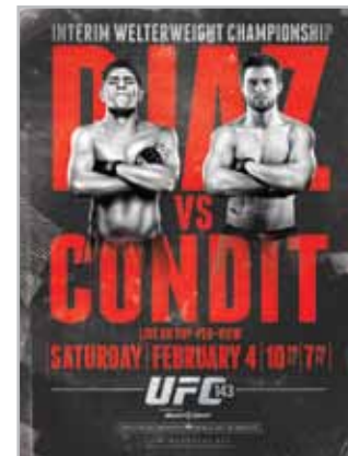
GUIDE AD • 8.5"x 11.25" CMYK • LAYERED • PRESS READY